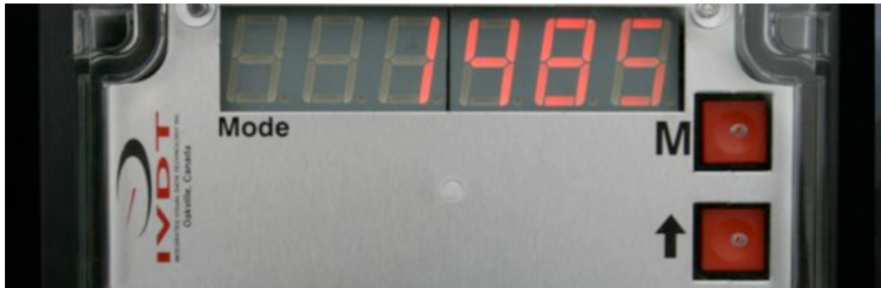
Mode LED Digit