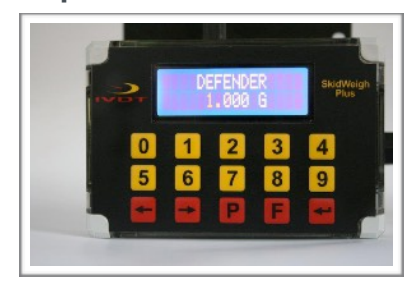
Impact Detection / Recordings are shown on LCD display and are recorded to USB