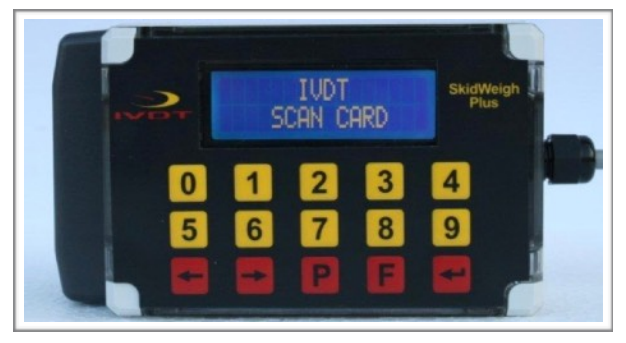
System with RFID Card reader