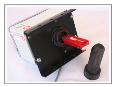
USB port with cover